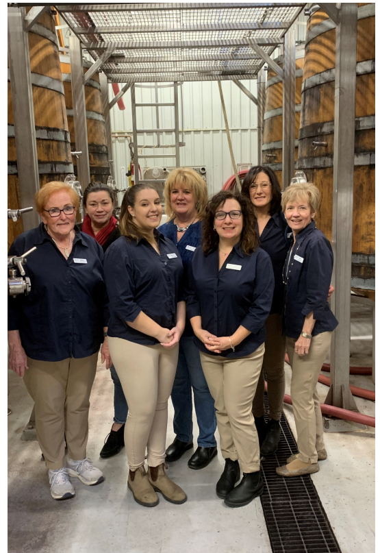
Thirty Bench Retail Team

Join the No.30 Wine Club for quarterly shipments of your favourite Thirty Bench wines right to your door! Learn More Here